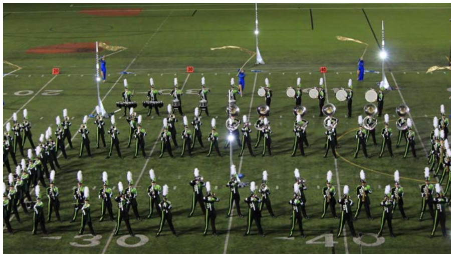
Marching Band Performance

“Music lessons have been shown to improve a child’s performance in school. After eight months of keyboard lessons, preschoolers showed a 46% boost in their spacial IQ, which is crucial for higher brain functions such as complex mathematics.”