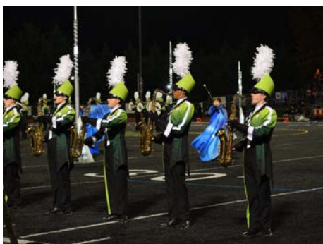
Home Game Performance