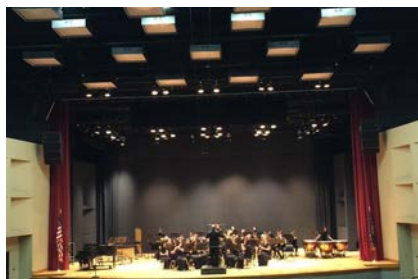
Wind Ensemble at OSU Contest

Nominations for open positions take place in March and April. Elections are held at the May parent meeting. Contact the volunteer coordinator or one of the executive board members if you are interested in an open position. All positions must be filled.