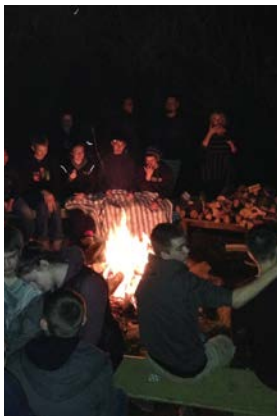
Wind Ensemble Retreat

*If a student is late and misses the bus, he/she may be brought to the activity by the parents. Once there, the student and parents will report to the band director. If the student is not brought by his/her parents, the student will not be allowed to perform and that will be treated as an unexcused absence from a performance.