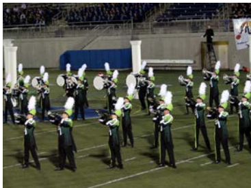
Marching Band at Grants Pass

Parent volunteering is critical to the success of our organization. Volunteering at various events and fundraisers helps keep the other fair share fees to a minimum. We need every parent to volunteer a few times throughout the year. Details and volunteer sign-up sheets will be available at the August parent meeting and the Premier Performance.