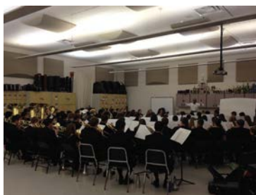
All-City Honor Band Rehearsal