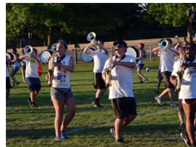
Marching Band Rehearsal