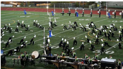
Marching Band Performance