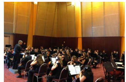
Full Symphony at Rotary