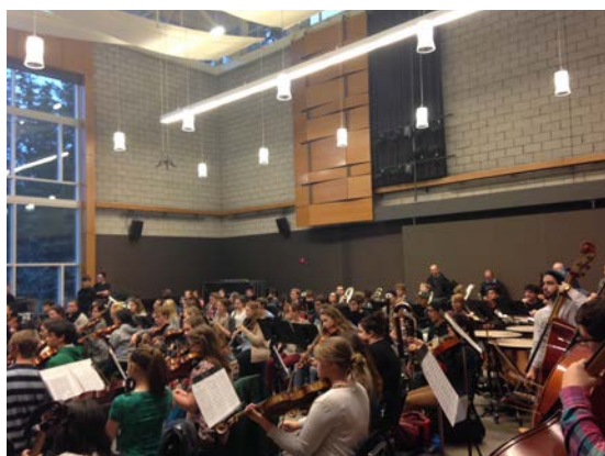
Full Symphony Clinic at UofO

In late May, we hold a year end awards night to celebrate the entire year for all ensembles and programs. Look for this date on the online calendar. Awards are given to students. We have a slide show and various video presentations. All parents, friends and family are invited. This is a great way to reflect back on the entire year and all of our accomplishments.