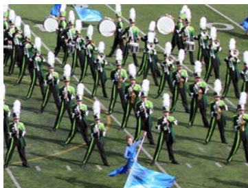
Marching Band at Hillsboro