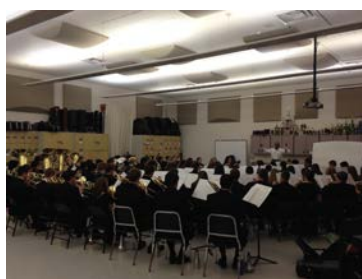
All-City Honor Band Rehearsal