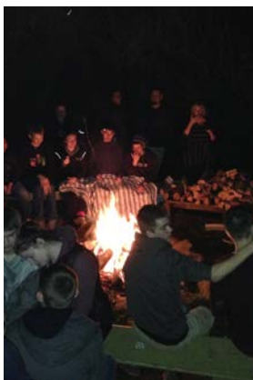
Wind Ensemble Retreat

*If a student is late and misses the bus, he/she may be brought to the activity by the parents. Once there, the student and parents will report to the band director. If the student is not brought by his/her parents, the student will not be allowed to perform and that will be treated as an unexcused absence from a performance.