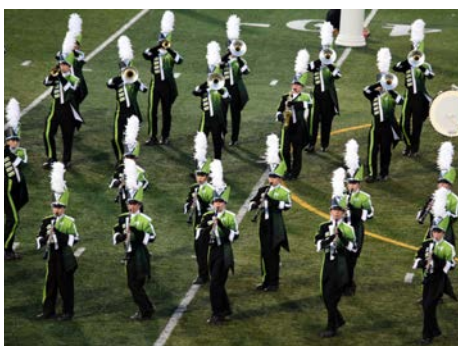
Home Game Performance