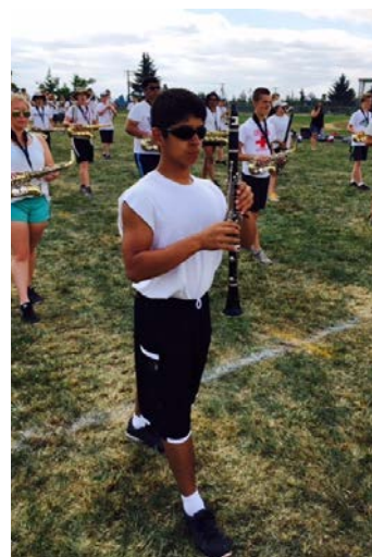
Marching Band Practice