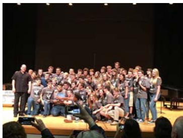
Wind Ensemble State Champions