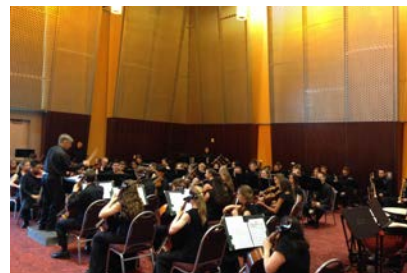
Full Symphony at Rotary