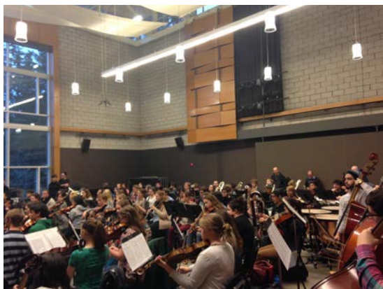
Full Symphony Clinic at UofO

In late May, we hold a year end awards night to celebrate the entire year for all ensembles and programs. Look for this date on the online calendar. Awards are given to students. We have a slide show and various video presentations. All parents, friends and family are invited. This is a great way to reflect back on the entire year and all of our accomplishments.