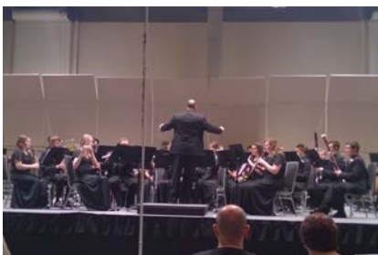
Wind Ensemble in Spokane, WA

Nominations for open positions take place in March and April. Elections are held at the May parent meeting. Contact the volunteer coordinator or one of the executive board members if you are interested in an open position. All positions must be filled.