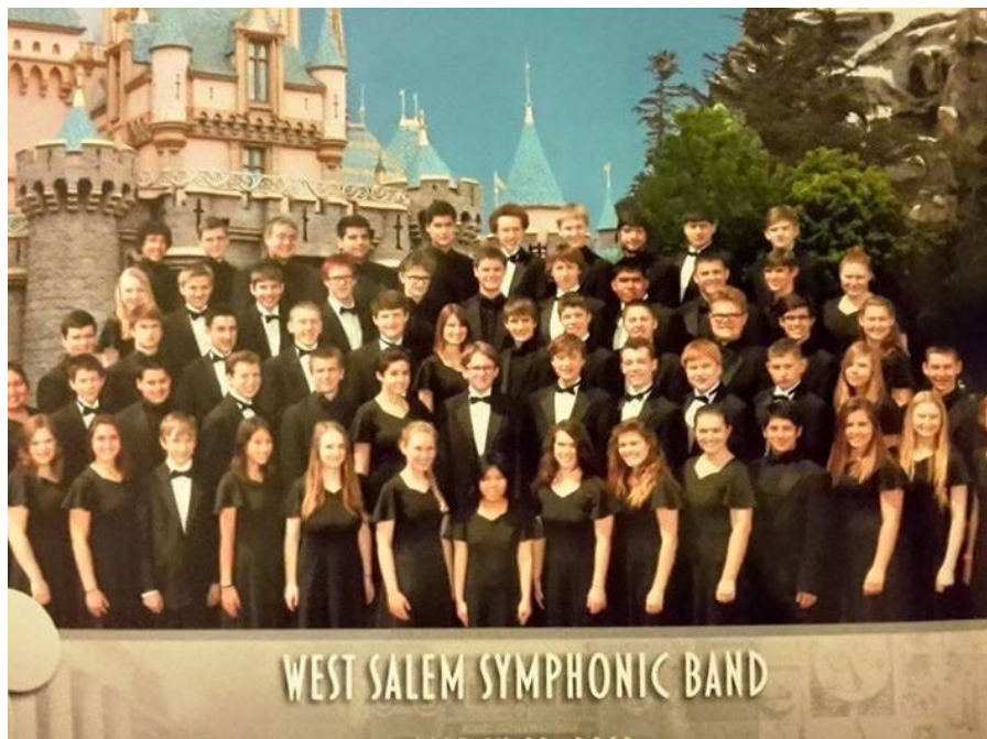
Disneyland Performance Tour