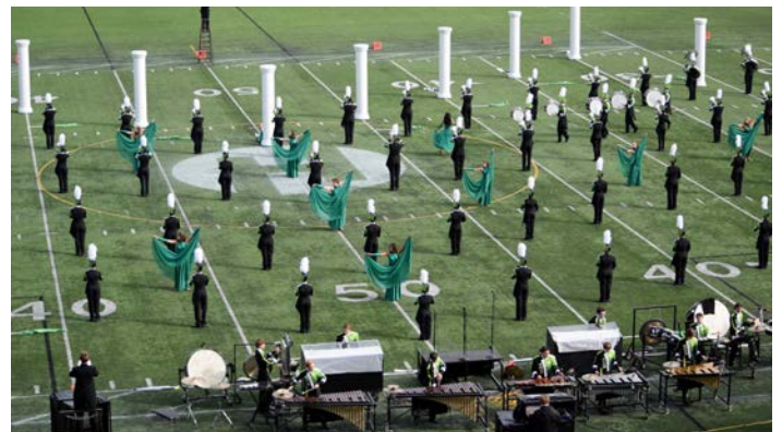
Marching Band Competition